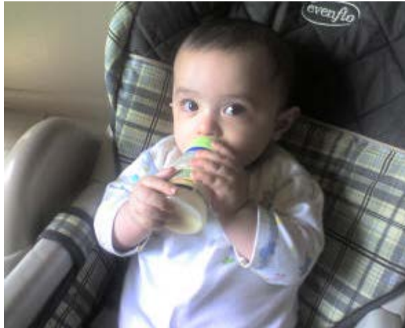
Gibby at 10 months