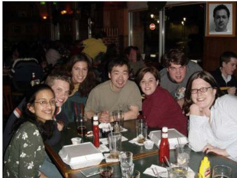
Lab Christmas Dinner at The Red Brick (of course) 2002