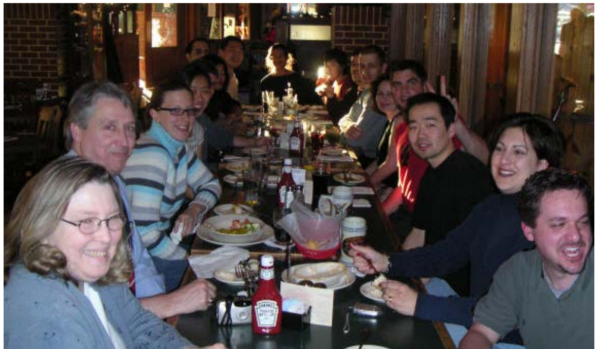
Lab ChrismaKwanzhannakahrammadan Party 2004 (at The Red Brick of course)