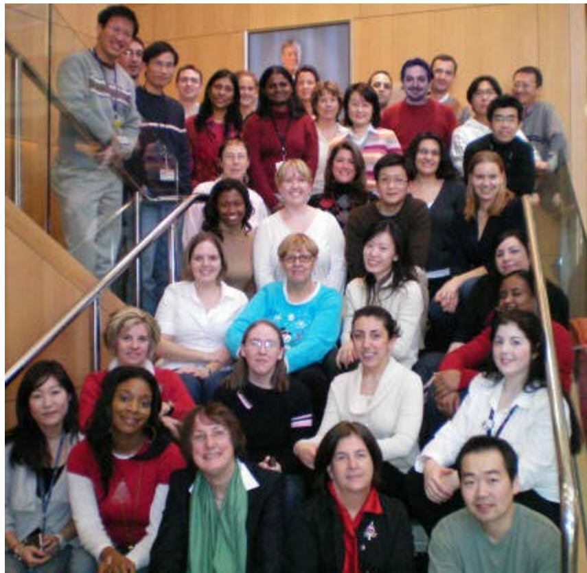
Breast Cancer Research Program Holiday Party 2007