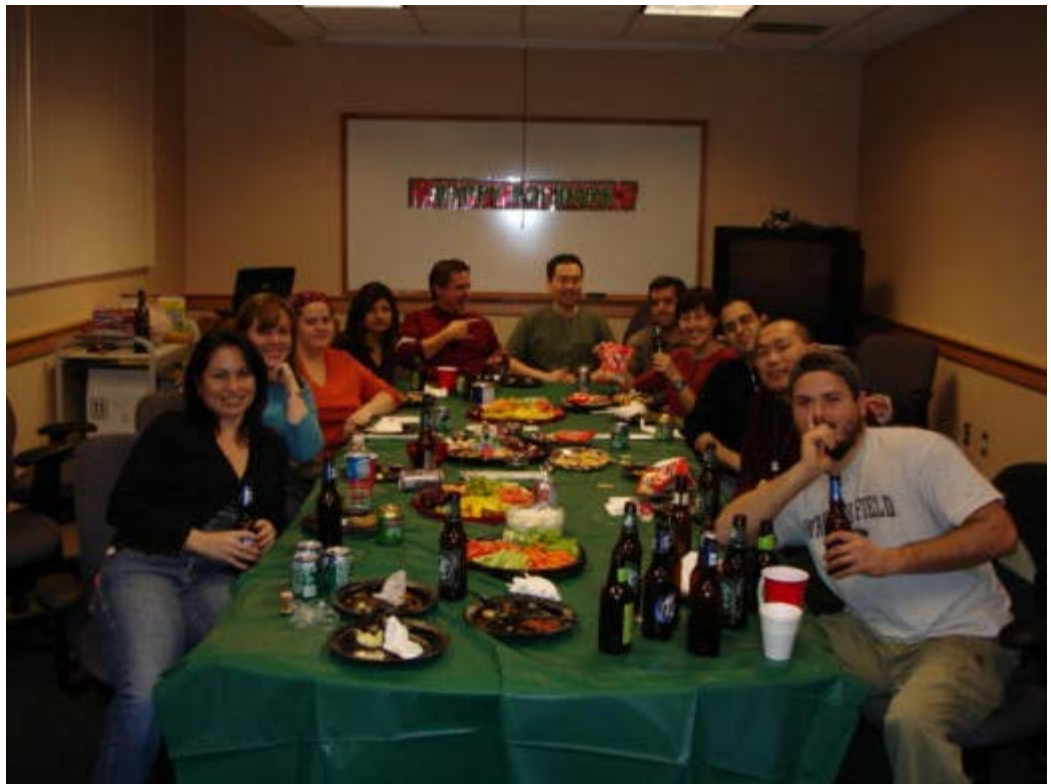
Lab Holiday Party 2005