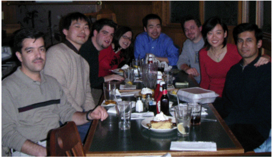
Lab Christmas Dinner at The Red Brick (of course) 2003